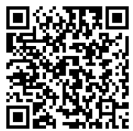
S410 3D demo