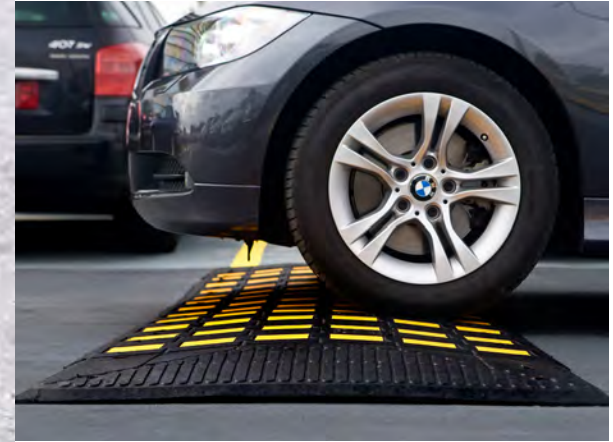
PICTURED: SAFETY RIDER SPEED HUMP

Checkers™ is a full-service manufacturer of parking lot safety solutions. We design and manufacture traffic control products that help cars navigate and park safely. Our main goal has been to create solutions that protect motorists and pedestrians from the perils of today's parking lots. As such, Checkers™ products have been designed and developed with speed reduction, driver and pedestrian safety in mind. All our solutions are manufactured from 100% recycled rubber and plastic. Our speed bumps or parking blocks, for example, are longer lasting, highly visible, and more car-friendly than asphalt or concrete alternatives. Not only are Checkers™ traffic safety solutions environmentally friendly, they can also be installed for either temporary or permanent use.