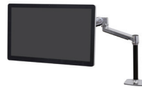
LX HD Sit-Stand Desk Mount LCD Arm